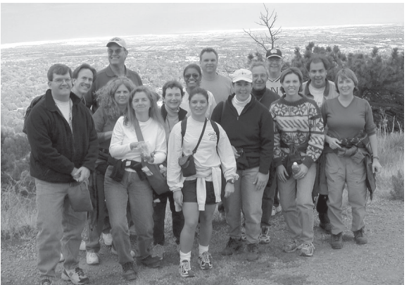
A hike in the Iron Mountains tested the grantee meeting participants' endurance and demonstrated their perseverance in achieving their goals.